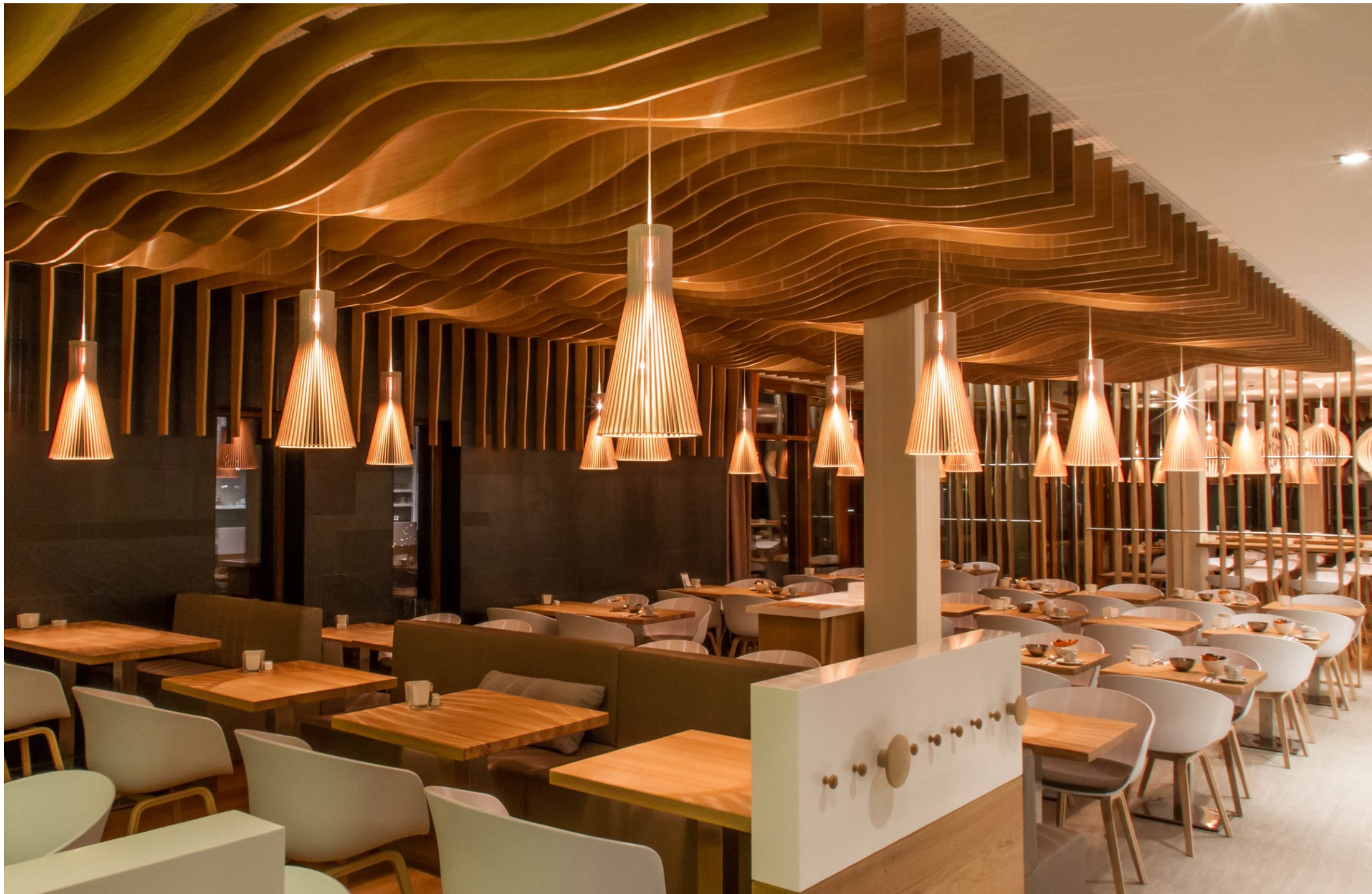
Secto 4200. Restaurant Deichkind. StrandGut Resort Lifestyle Hotel. St. Peter-Ording, Germany. Interior design and photo by Cubik³.