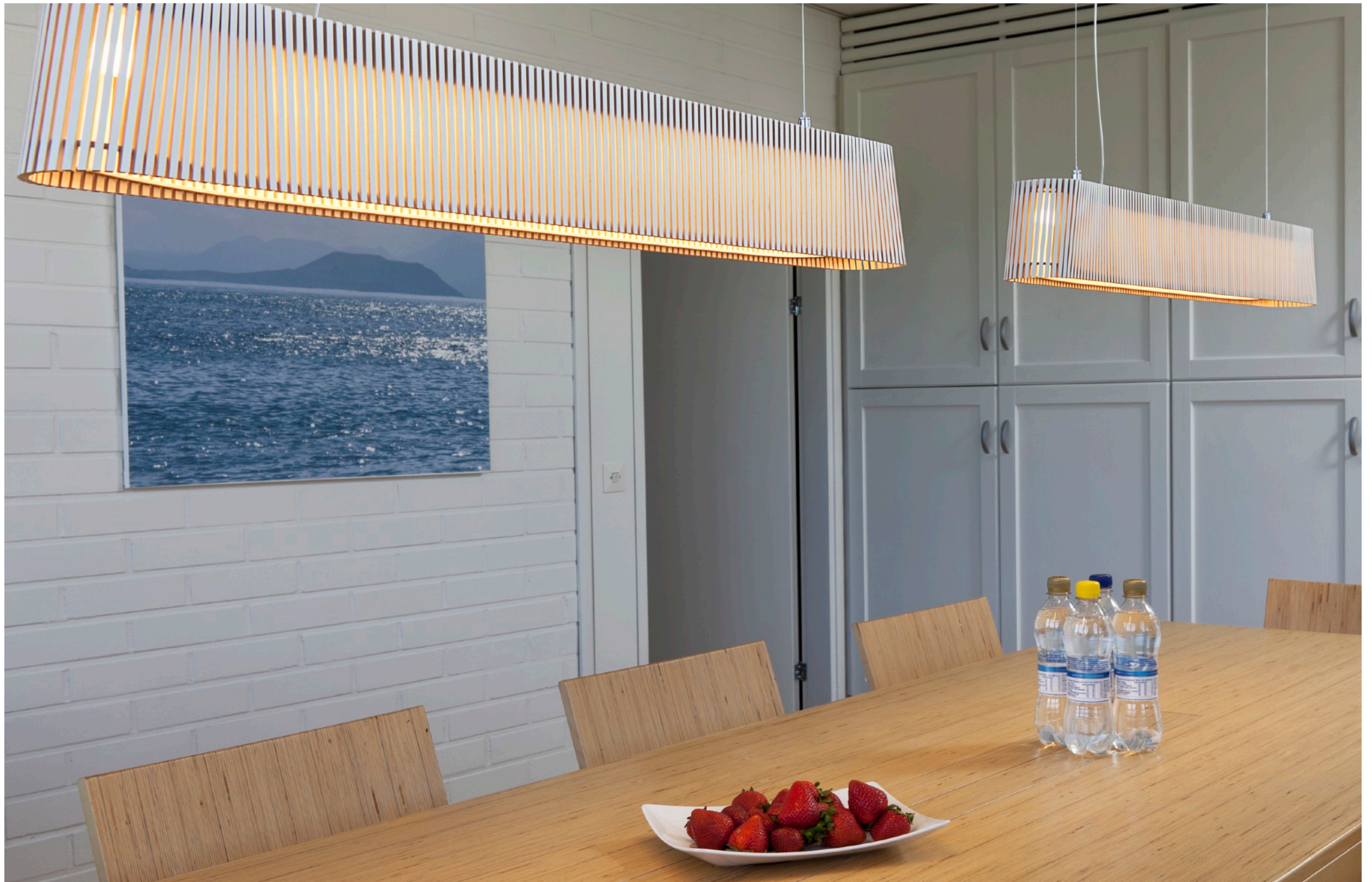
Owalo 7000. Office. Espoo, Finland.