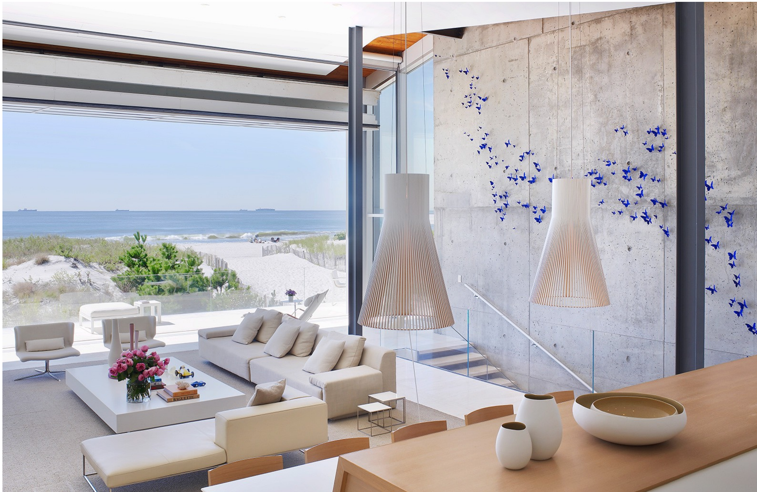
Magnum 4202. Long Island Residence. New York, USA.