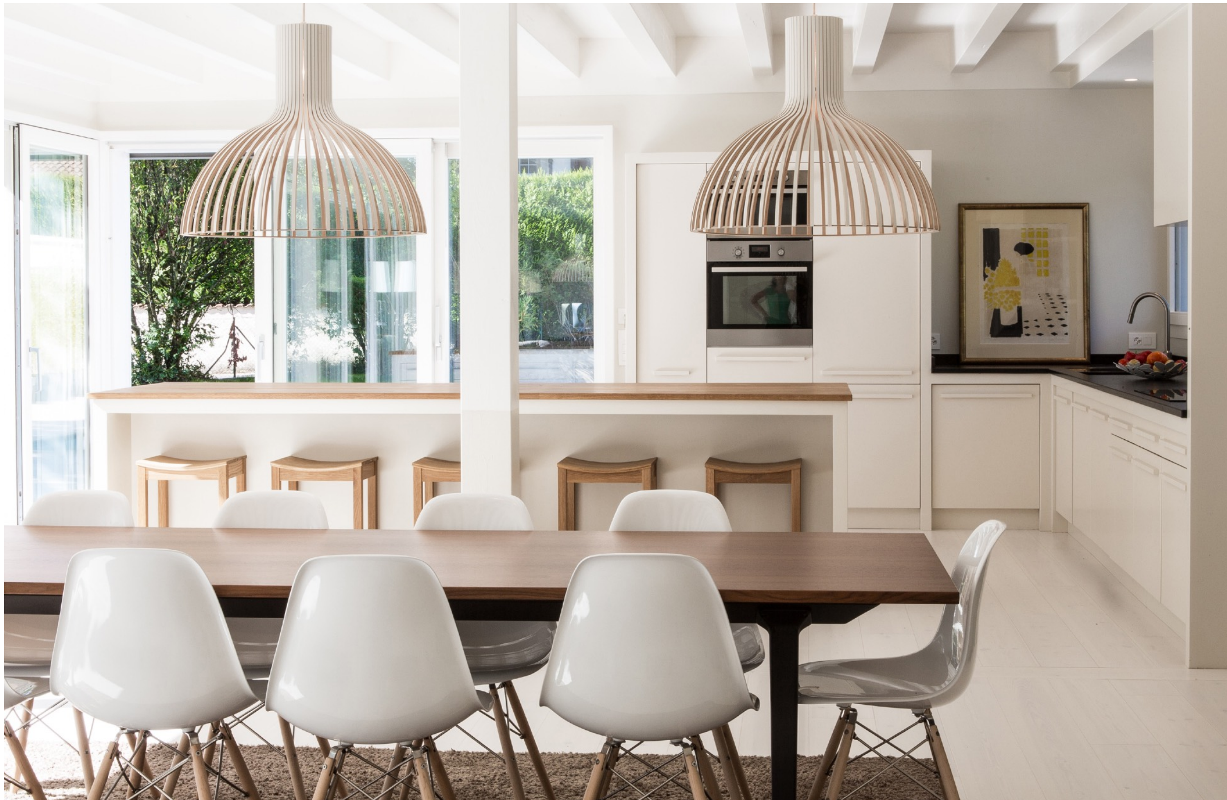
Victo 4250. Private Residence. Genolier, Switzerland. Interior Design by Bär & Marée Architectures.