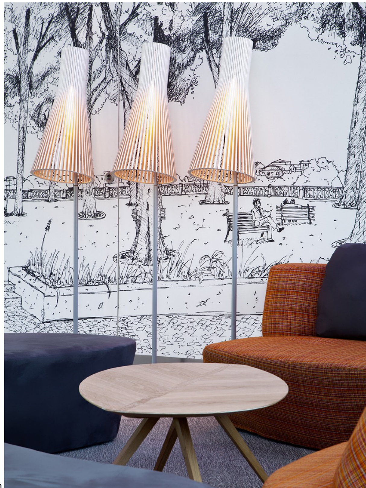
Hotel Evolution. Lisbon, Portugal.

Visit www.sectodesign.com to view the collection.