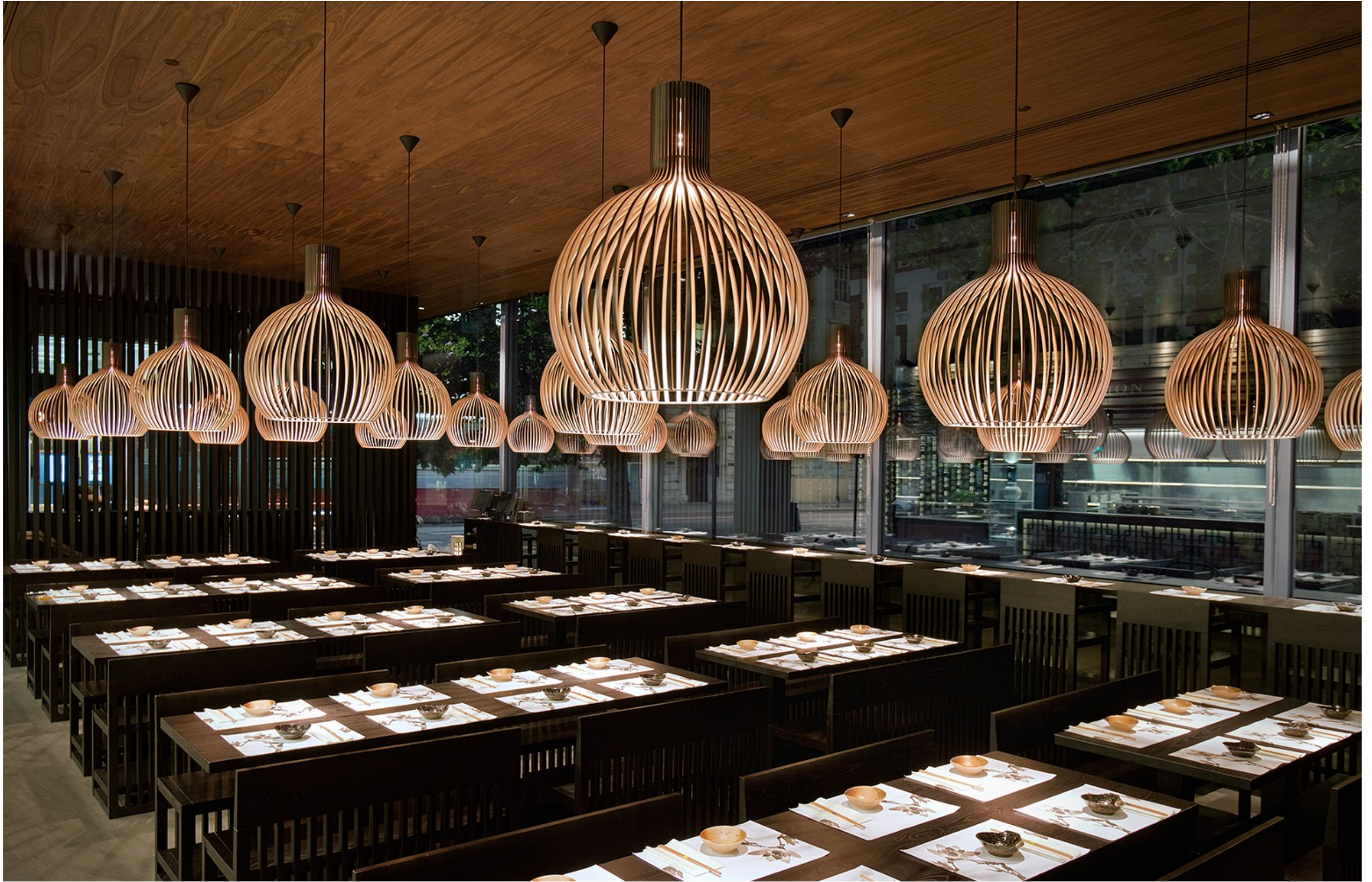
Octo 4240. Korean Restaurant Kimchee. High Holborn, London, UK.