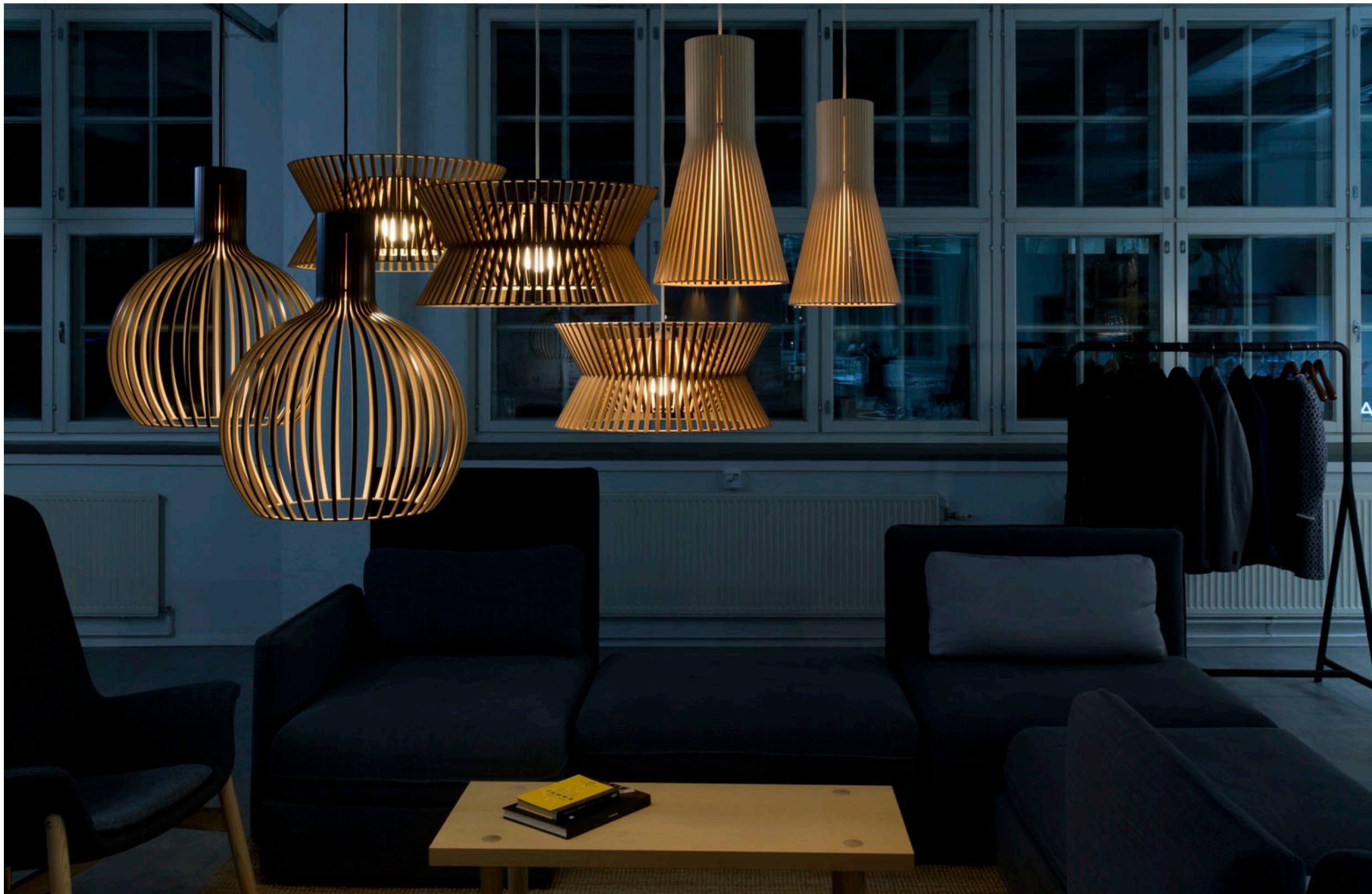
Octo Small 4241, Kontro 6000, Secto Small 4201. Lamps shot at Nespresso Professional Oy. Helsinki, Finland.