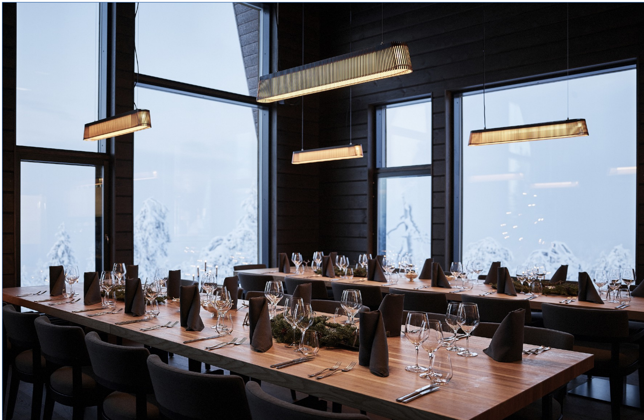
Owalo 7000. Octola Private Wilderness. Rovaniemi, Finland.