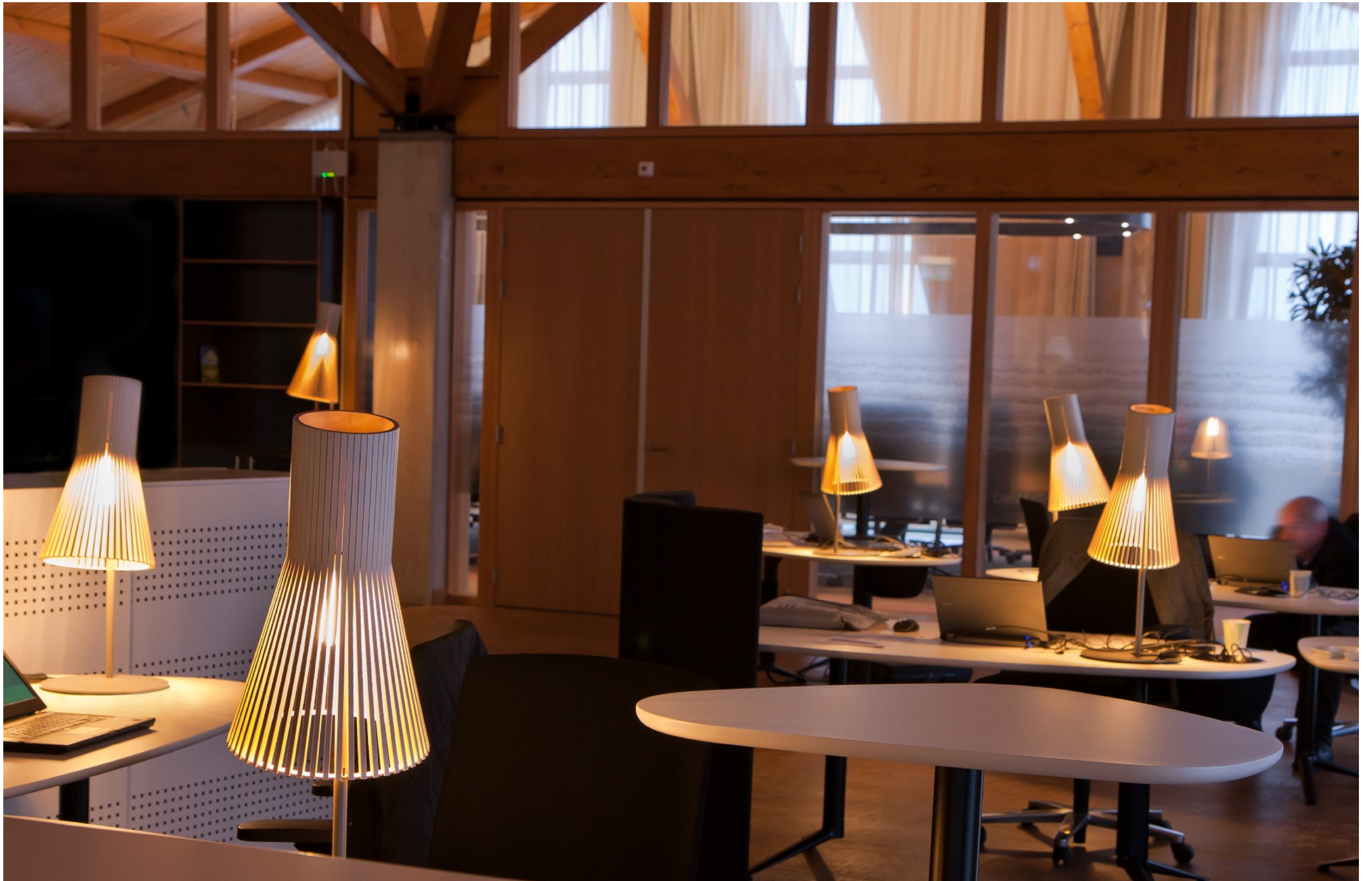
Secto 4220. ZLTO office. 's-Hertogenbosch, The Netherlands.