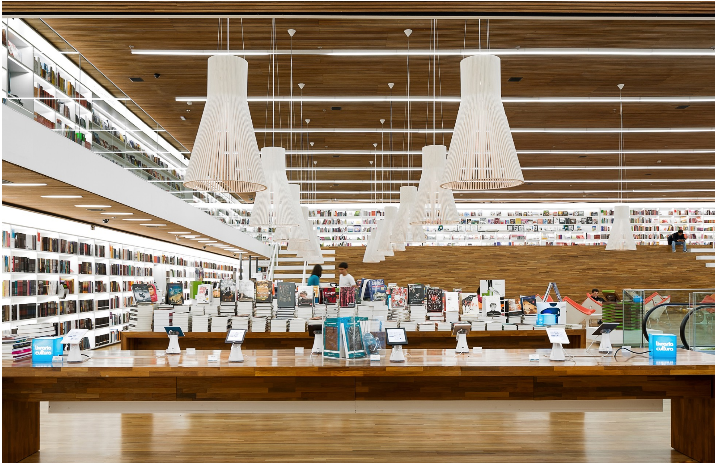
Magnum 4202. Livraria Cultura. São Paulo, Brazil. Project by studiomk27.