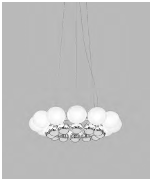
24PEA SP BCCM CR G9 UL