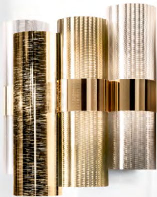
LA LOLLO APPLIQUE - GOLD