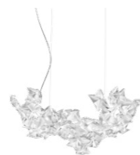
PRISMA RED WIRE