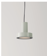
Arne S Domus

The technical information provided by Santa & Cole may be modified at any time without prior notice. We protect intellectual property. info@santacole.com / +34 938 619 100 / santacole.com