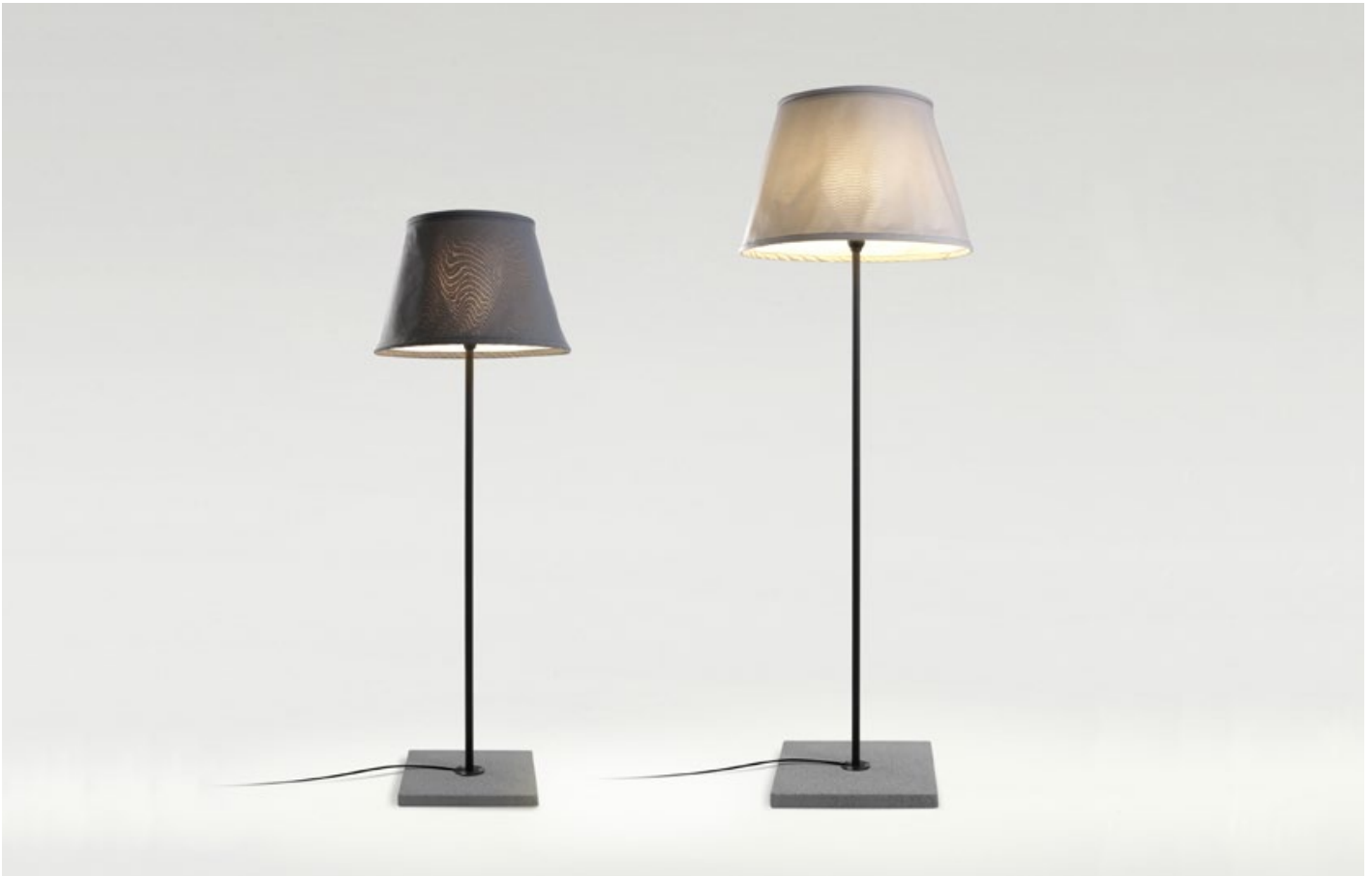
TXL 2019 205