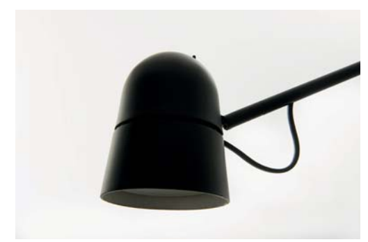
(*) The LED lamps cannot be changed in the luminaire