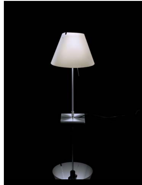
D13 pi. - D13 pi.c

Reference code: Complete Version D13 pi.c 1D13=NP0C520 alu body/white shade D13 pi 1D13=NP00520 alu 1D13=NP00503 off white 1D13=NP00530 brass D13 pi.pt. 1D13PNP00520 alu 1D13PNP00503 off white Shade D13pi./1 1D130NP01502 white Mezzo Tono collection D13pi./1 1D130NP01537 comfort green 1D130NP01524 edgy pink 1D130NP01534 mistic white 1D130NP01538 soft skin 1D130NP01539 shaded stone Radieuse collection D13pi./1 1D130NP01508 primay red 1D130NP01501 liquorice black 1D130NP01536 petroleum blue 1D130NP01506 smart yellow 1D130NP01505 concrete grey