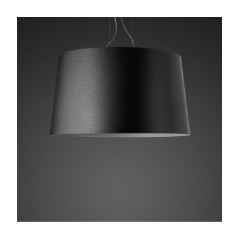
Twice as Twiggy