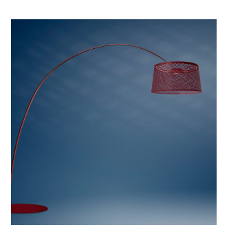
Twice as Twiggy Grid