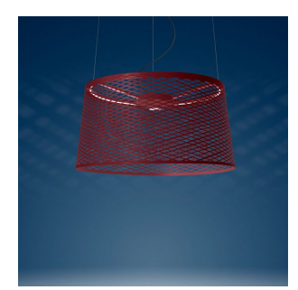
Twice as Twiggy Grid