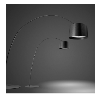
Twice as Twiggy