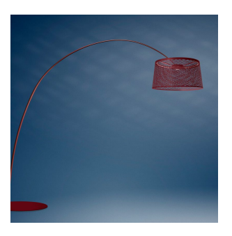
Twice as Twiggy Grid