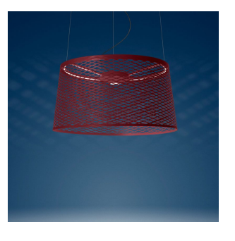
Twice as Twiggy Grid