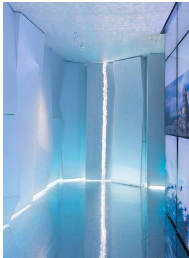
Expo Valle d'Aosta, Milan

Wall Rupture es una luminaria invisible realizada en Soft Composite. El efecto es como de un pliegue secreto en la pared que oculta el relieve irregular de la tierra. Disponible en color oro y plata. Incorpora tiras de LED con diferentes temperaturas de color: 2700K (versión decorado oro) ó 5000K (versión decorado plata).