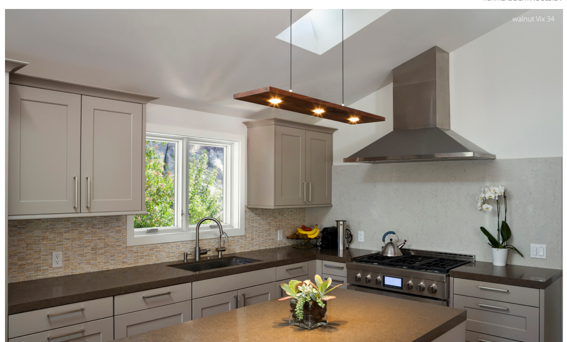
EURO KITCHEN & BAT

A clean, modern fixture finely executed. With multiple down and up lights, the Vix provides lots of usable light in a very unobtrusive design.