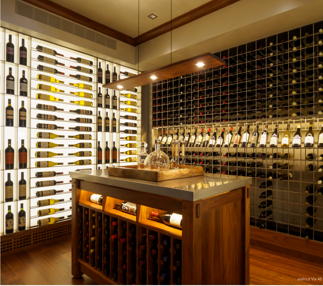
RON NEAL LIGHTING DESIG