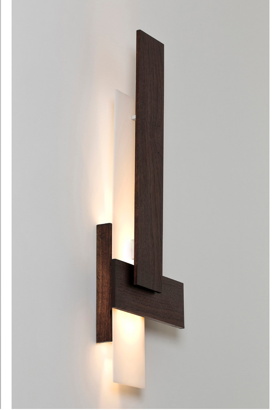
dark stained walnut