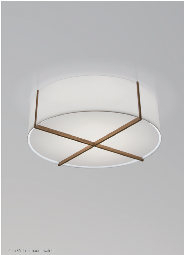
Plura 36 flush mount, walnut

The Plura is a simple, straight forward fixture that is excellently executed. With the Plura it was about resolving the seams and edges and their relationships to one another. The result is a scalable fixture that has a sharp, sophisticated feel.