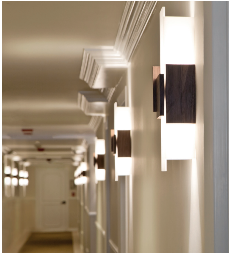
Lynda Murray Design