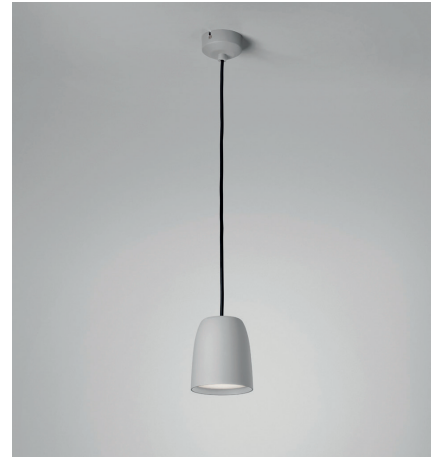
Image does not show north American back plate La fotografía no muestra la placa de fijación