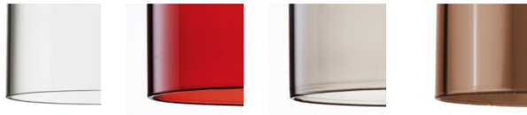
CS Crystal RS Red GR Grey BR Metallic bronze

USSPIL10 __ CR__ CUSTOMER _____ NOTES _____