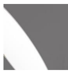
AN anthracite grey