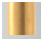
OT Natural brass

EELc (Energy Efficiency Label compatibility) contain built in LED lamps that cannot be changed: A, A+, A++