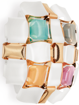
MIDA APPLIQUE - MULTICOLOR