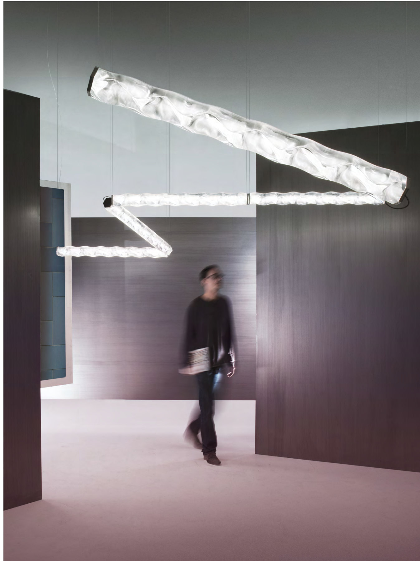
An installation of 5 Prisma elements. Esempio di installazione di 5 elementi nella versione Prisma.