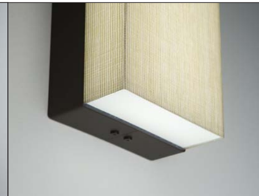
END CLOSURE DETAIL - 6603-30 DASH