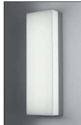
CUSTOM 6547-18 MESH