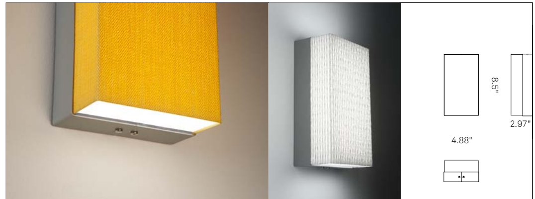
END CLOSURE DETAIL 6427-720 METEOR