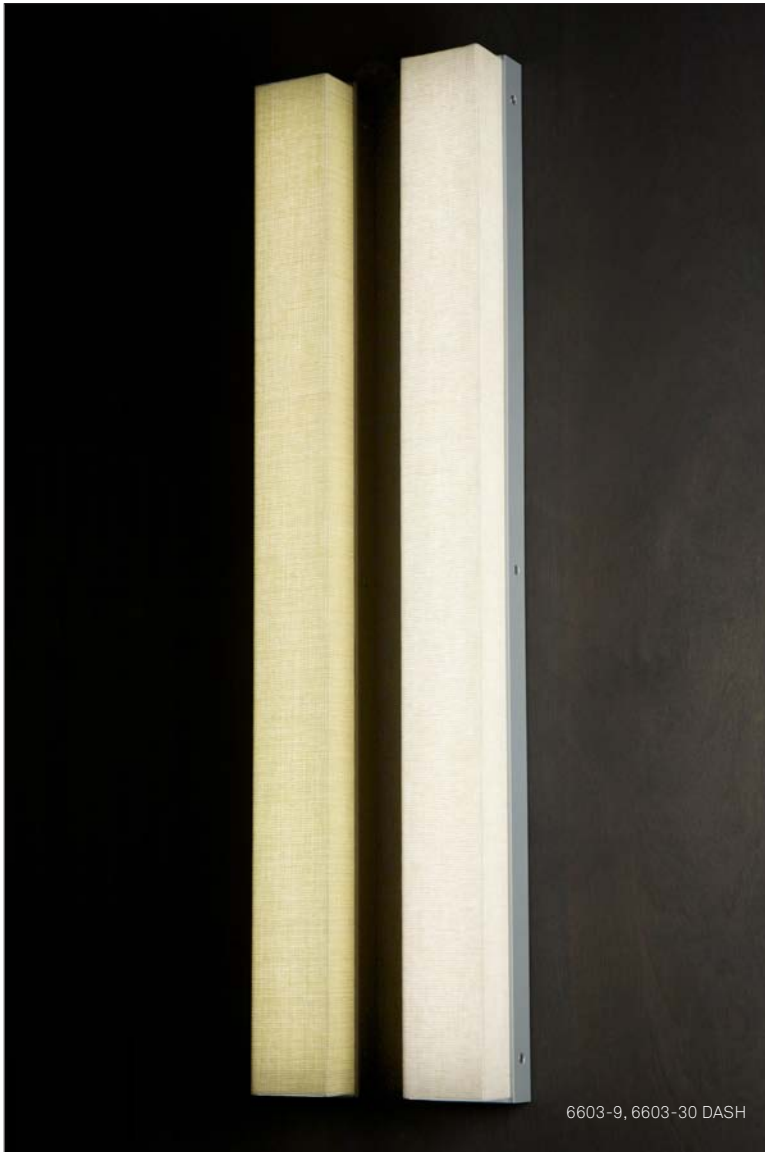
6603-9, 6603-30 DASH