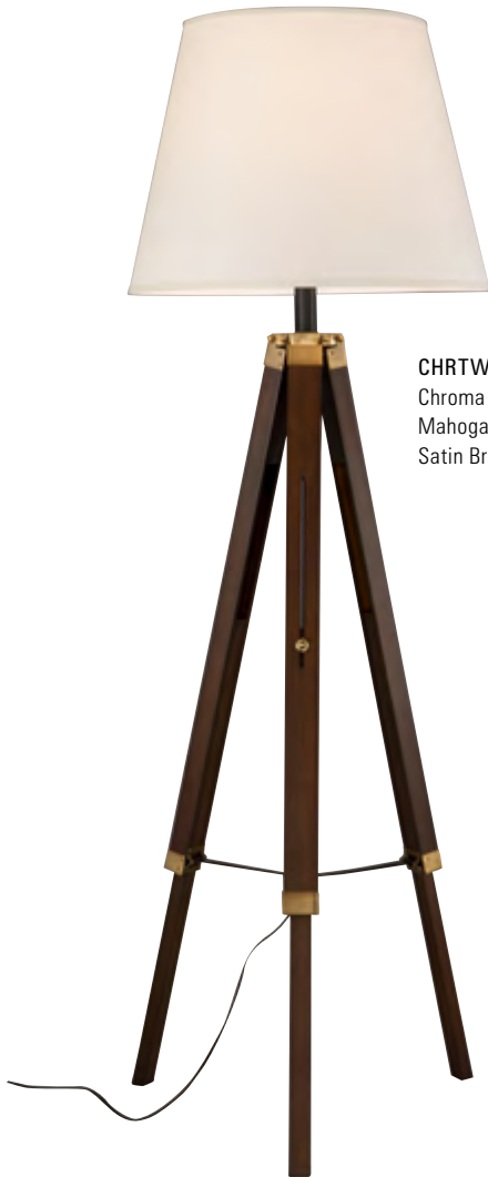
CHRTWS Chroma Tripod with White Shade Mahogany Wood Satin Brass / SB