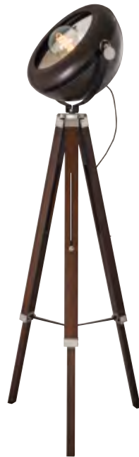
CHRTR Chroma Tripod with Dome Mahogany Wood Brushed Nickel / BN