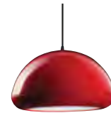
CHR Chroma Pendant Shiny Red Powder Coat / SRPC