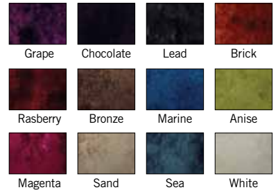
Grape Chocolate Lead Brick Raspberry Bronze Marine Anise Magenta Sand Sea White