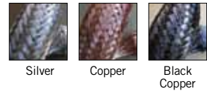
Silver Copper Black Copper