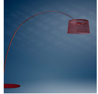
Twice as Twiggy Grid