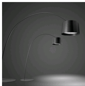
Twice as Twigggy