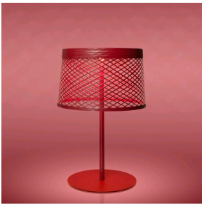
Twigggy Grid XL