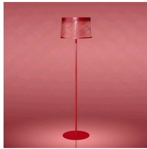
Twigggy Grid Lettura