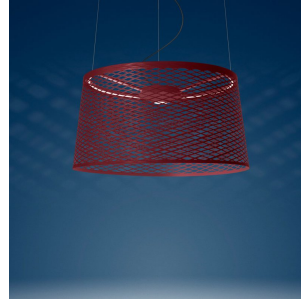
Twice as Twigg Grid