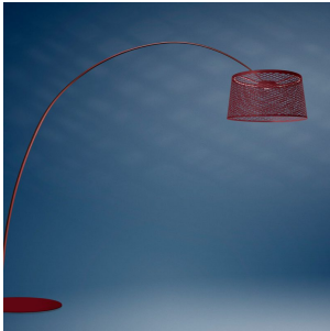
Twice as Twigg Grid