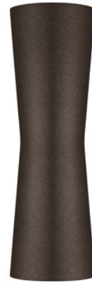
FU158318 Deep Brown