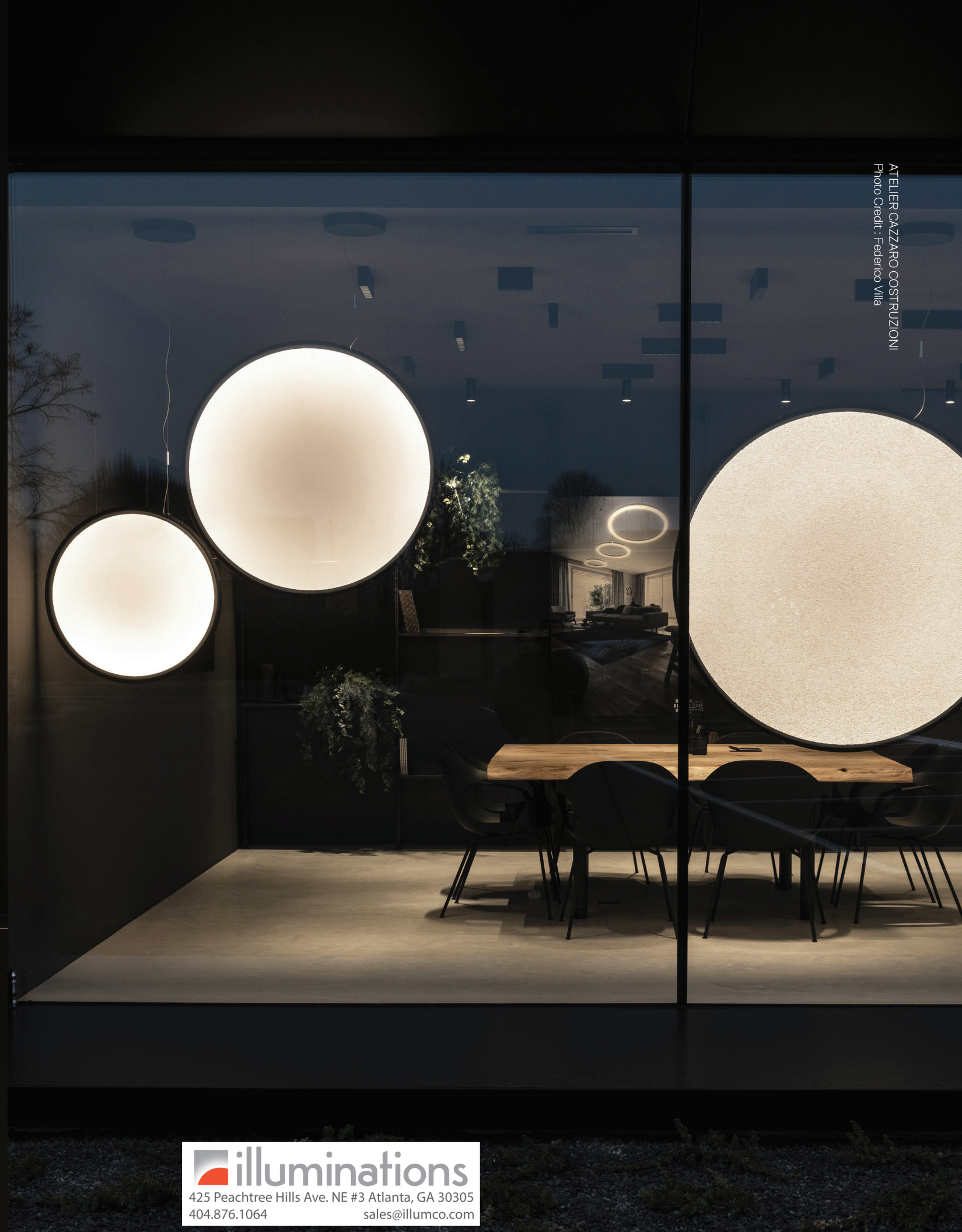
ATELIER CAZZARO COSTRUZIONI