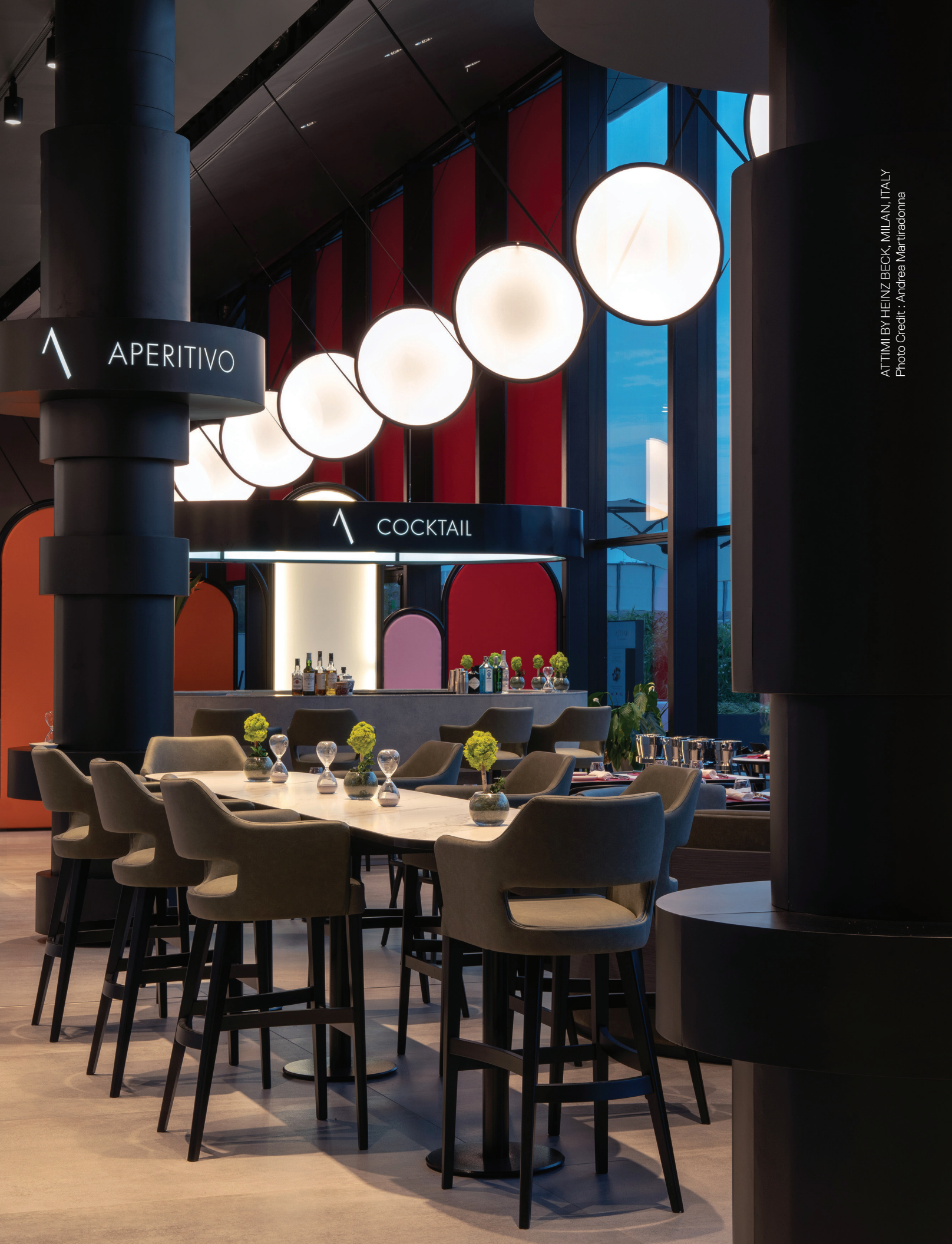
ATTIMI BY HEINZ BECK - MILAN, ITALY